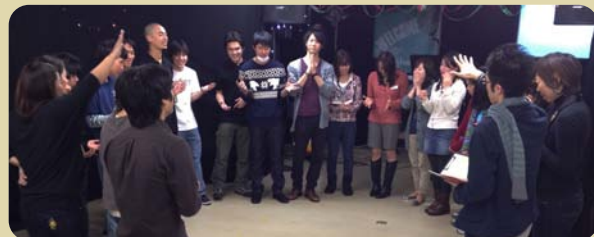
This prayer meeting has 20+ attending every week!