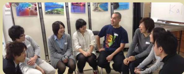
Aloha English Club drew in a bunch of new friends.