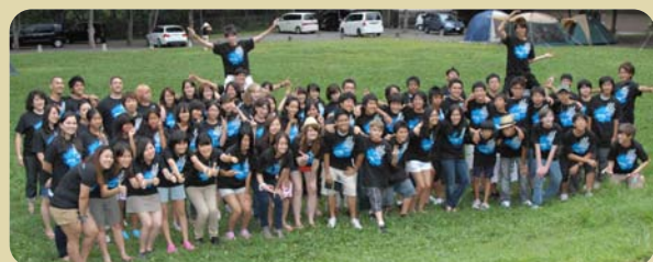
Camp in August was "atsui!" (hot/exciting!)