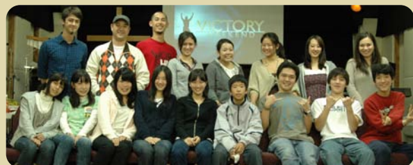
1 st ever Youth Victory Weekend. Big breakthroughs!