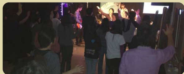
Our youth worship service got cool lights this year.