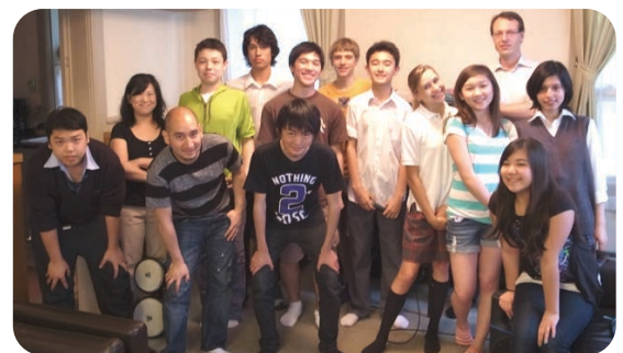
About 15 of us gathered for our first Greenhouse event on May 14.

These two new outreaches are on Tuesdays and Fridays. Our Aloha English Club that targets college students is still running strong on Wednesdays. We didn't get to mention a monthly guitar club that we're trying out on Saturdays. And we have young leaders in their mid-twenties coming on strong to run all four of these outreaches as time progresses. You're a part of this! Thanks for your prayers and support!!!