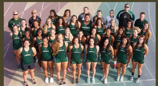
We've had at least 10 different track girls visit a worship service, bible study or ministry event.

You're a big part of every life that we are touching. We wish we could share each story with you. Our family is off to a nice time of vacation in Japan, our first visit back after a year and a half. We're all so excited to see our friends – especially the kids! Have an awesome Christmas, and a Happy, Happy New year!!!